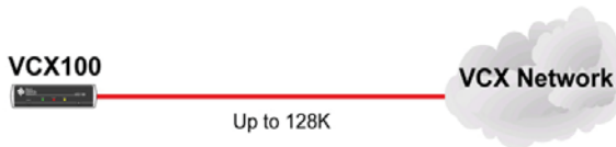
Part of a VCX Network