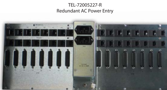
TEL-72005227-R Redundant AC Power Entry