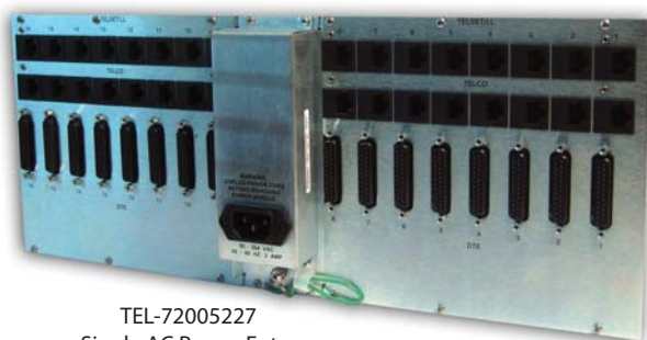
TEL-72005227 Single AC Power Entry